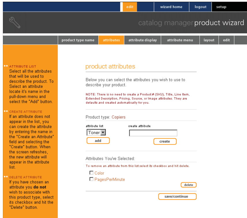
Figure 4-4 Selecting, adding, and deleting product attributes